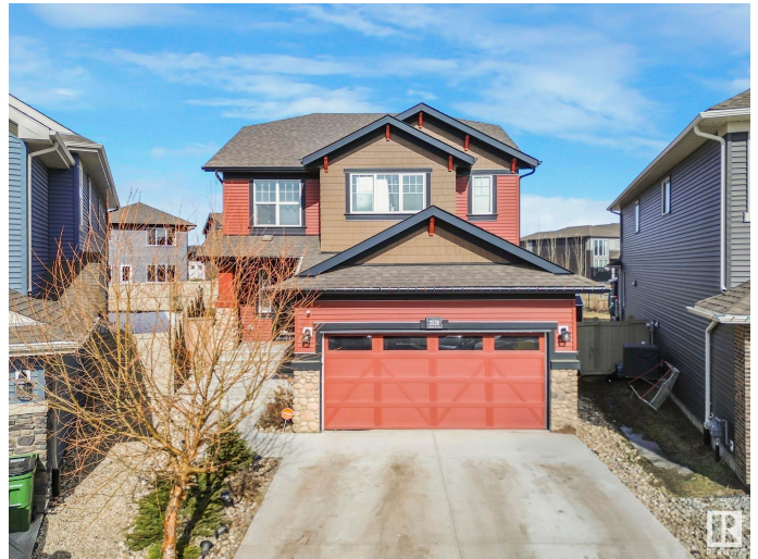
2539 Orchards Way SW, Edmonton, AB

MLS® # E4427515 Price $850,000 Bedrooms 6