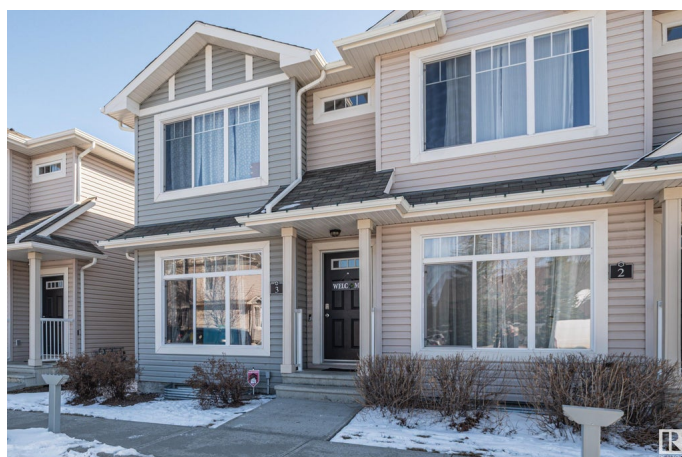
3-6032 38 Ave NW, Edmonton, AB

Main Floor Exterior Area 487.63 sq ft Interior Area 437.16 sq ft