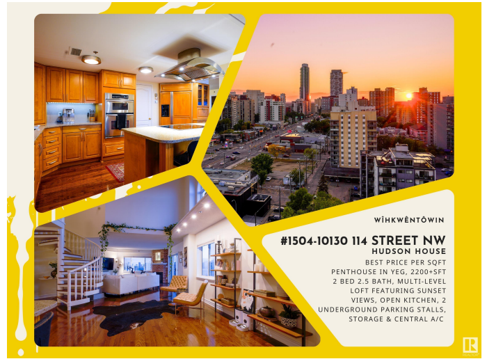
#1504 10130 114 STREET HUDSON HOUSE OLIVER, EDMONTON