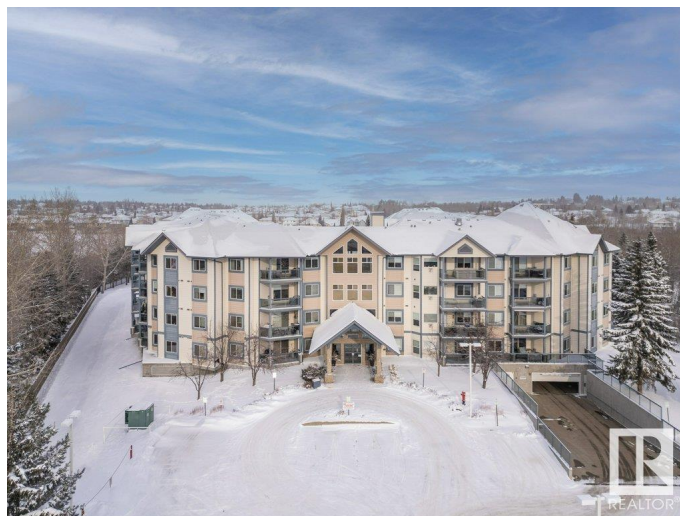
414-100 Foxhaven Dr, Sherwood Park, AB